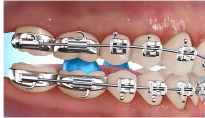
Bite Turbos (metal)